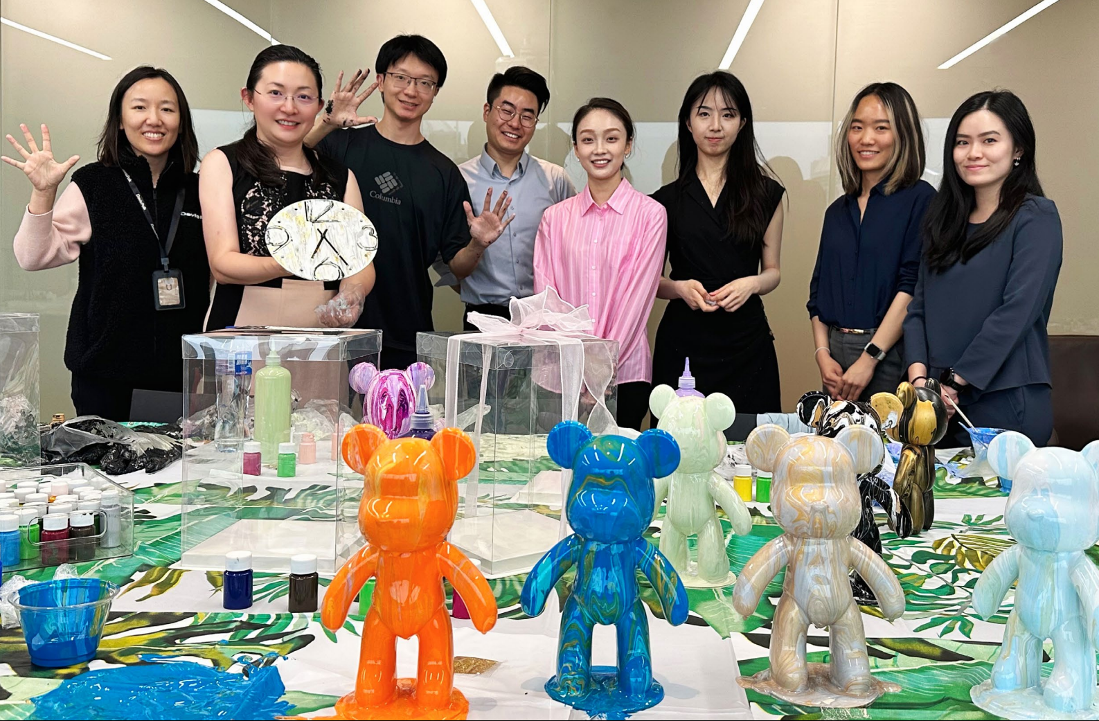
Summer associates, trainees and Beijing interns enjoy a water marbling class.