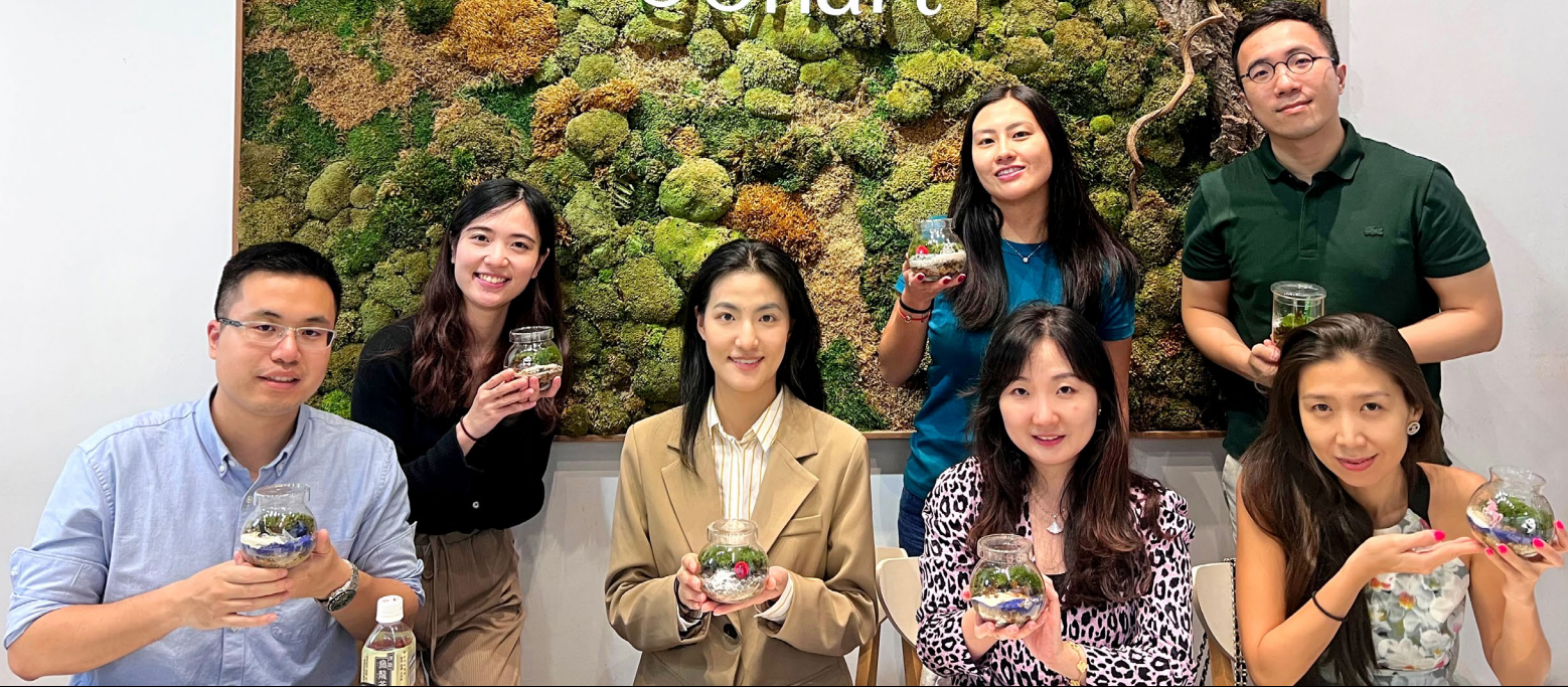
Summer associates and lawyers enjoy creating moss terrariums.