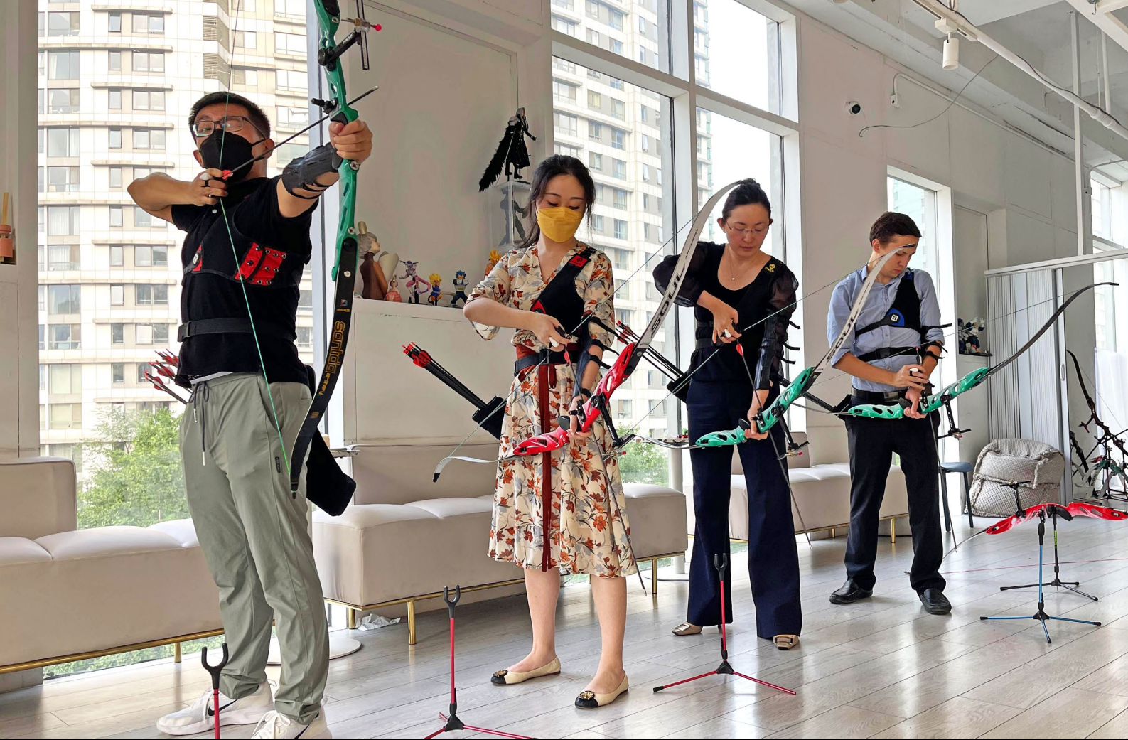
Summer associates and lawyers learning archery.