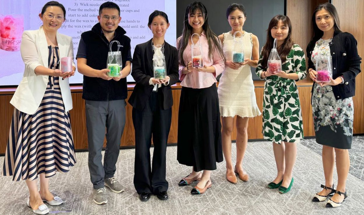
Summer associates, vacation scheme students and lawyers enjoy a color candle making class.