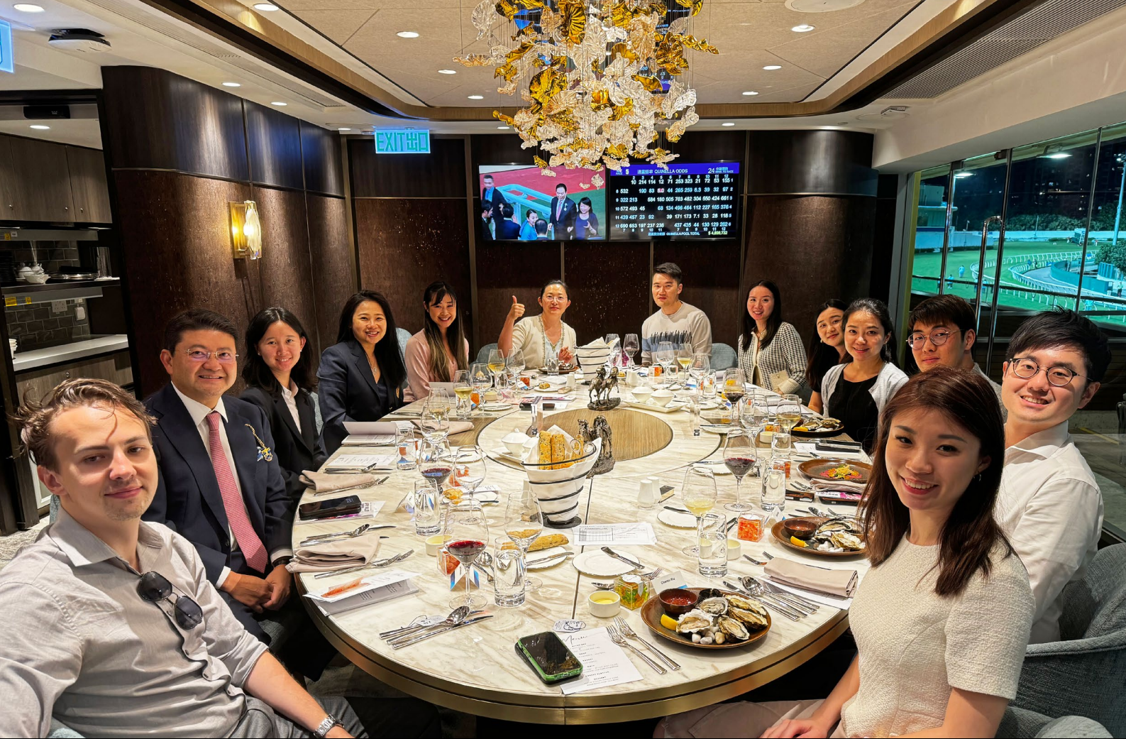
Summer associates, vacation scheme students and lawyers gather for a horse racing night dinner at the Hong Kong Jockey Club.