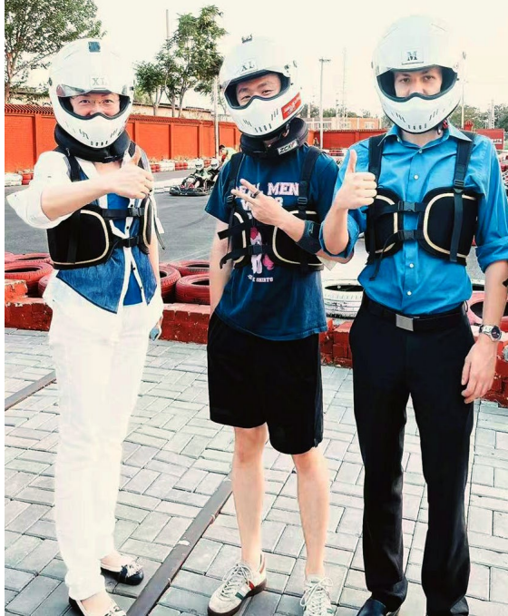
Summer associates and lawyers enjoy go-karting.