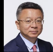
Bo Li Deputy Managing Director, International Monetary Fund