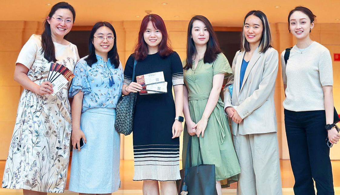
Summer associates, Beijing interns and lawyers gather for a classical music night at the China National Opera House.